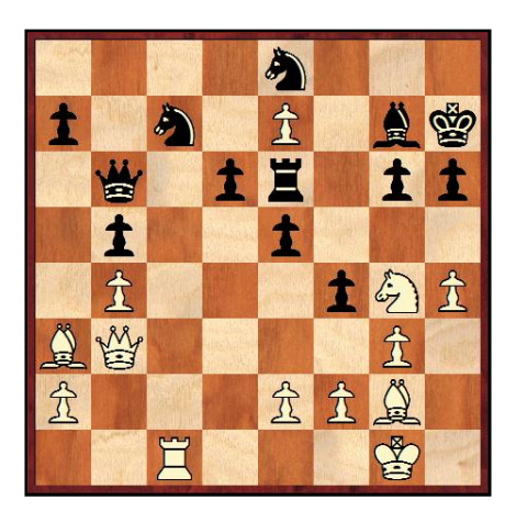
Raymond Keene Position after 27...Re6

Although White's pawn on e7 is only one square away from promoting, it appears to be going nowhere as it is surrounded by Black's pieces.