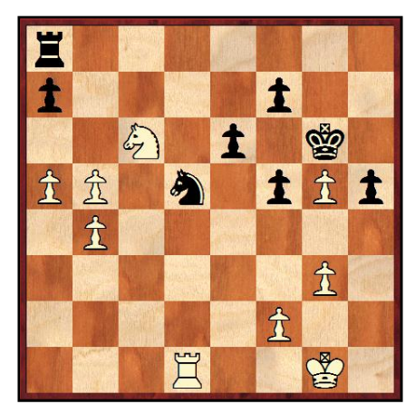
Paul Troeger Position after 41...Kg6