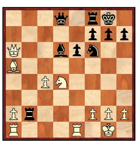
8. Fred Spell - Ken MacRae East Coast Deli, May / 2011 Black to Move