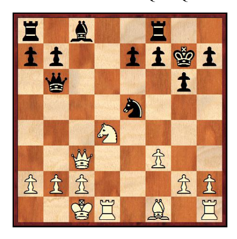
14.Nb3 f6 15.Qc5 Qxc5 16.Nxc5 b6 17.Nd3 Nc4 18.Re1 e5 19.b3 Nd6 20.Nb4 Bb7 21.Ba6 Bxa6 22.Nxa6 Rac8 23.Rd1

1.e4 c5 2.Nf3 g6 3.d4 cxd4 4.Nxd4 Nc6 5.Nc3 Bg7 6.Be3 Nf6 7.f3 0–0 8.Qd2 Ne5 9.Bh6 d5 10.Bxg7 Kxg7 11.exd5 Nxd5 12.0–0–0 Nxc3 13.Qxc3 Qb6