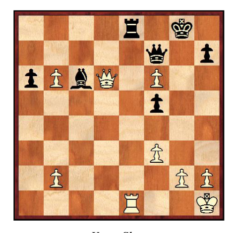
Yang Shen Position after 31...Re8