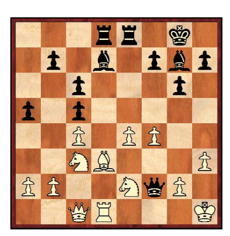
4. K. Kondracki - Z. Bekkedahl DCC King Hunt / 2011 Black to Move