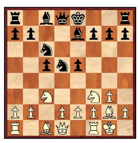
7. A. Telinbacco - J. Irwin Colorado Class / 2011 White to Move