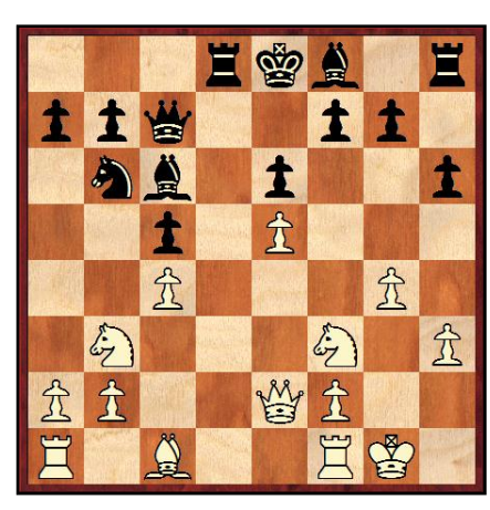
9. Rhett Langseth - Daniel Zhou Scholastic Closed / 2011 White to Move