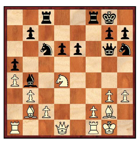
5. Brian Wall - Eric Montany DCC King Hunt / 2011 White to Move